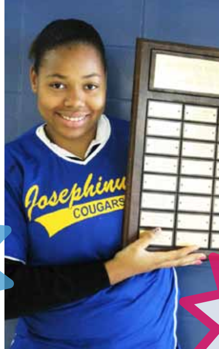
Softball 2011 Blue Division Champions