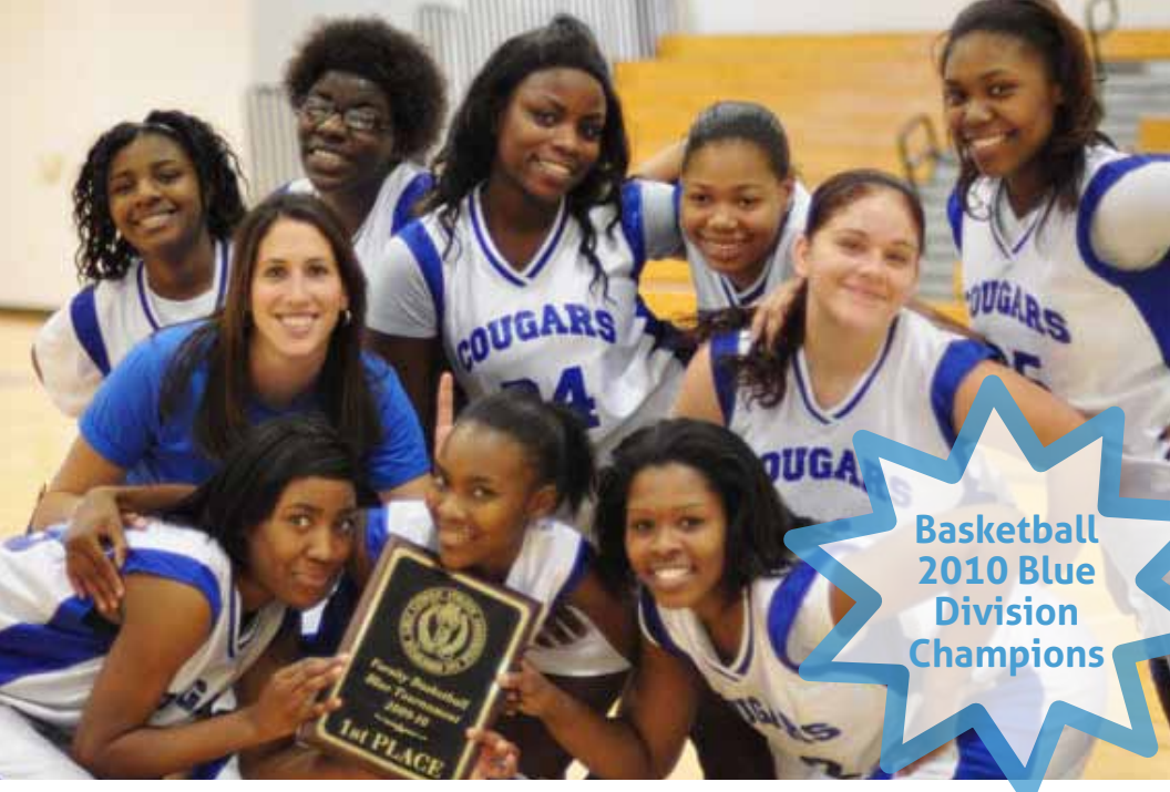
Basketball 2010 Blue Division Champions