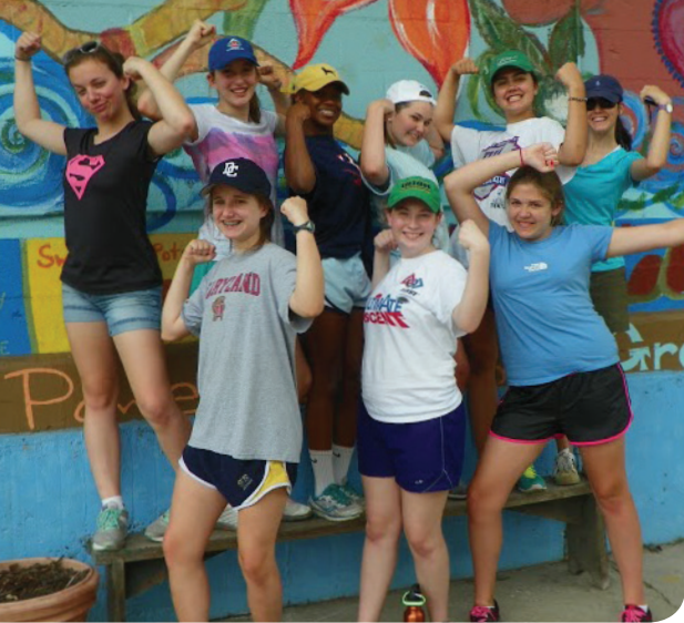
Sacred Heart students from around the country participating in Josephinum's Summer Service Trip