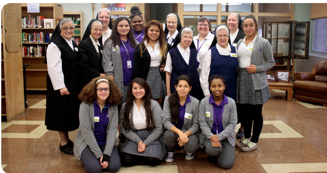
Eight students from Josephinum's newly-formed Sisters of Christian Charity Mentoring Group were honored to share a meal with several sisters from the order that originally founded Josephinum in 1890.