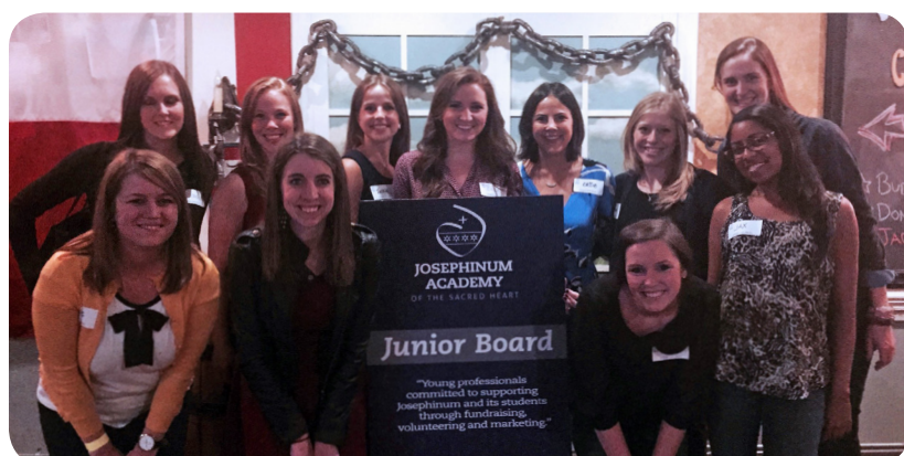
Members of Josephinum's new Junior Board pose at Stanley's Kitchen and Tap during their fundraiser that raised over $3,000 in support of Josephinum's music club.