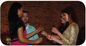
Juniors thank Seniors with a rose