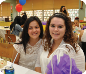
Josephinum graduates enjoy the Senior Luncheon